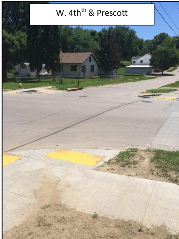
W. 4th th & Prescott