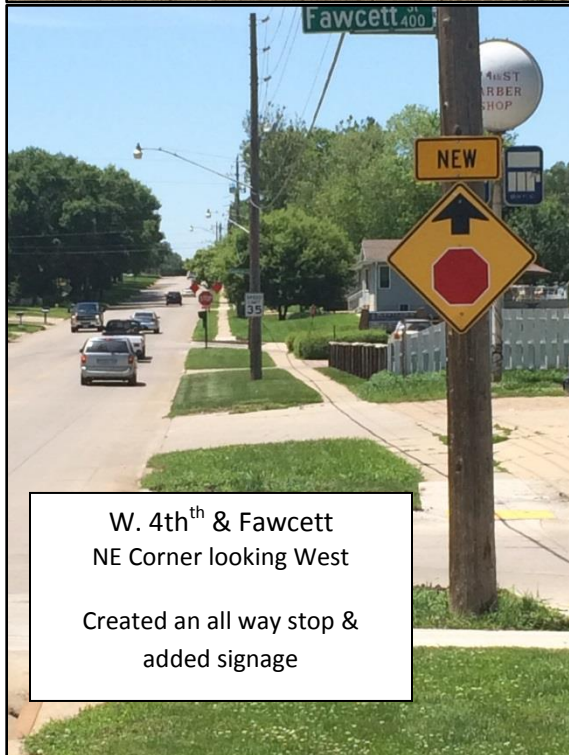
W. 4th th & Fawcett NE Corner looking West Created an all way stop & added signage