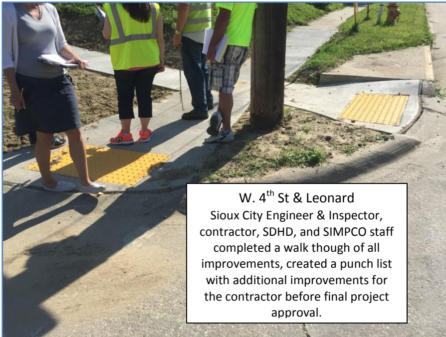
W. 4 th St & Leonard Sioux City Engineer & Inspector, contractor, SDHD, and SIMPCO staff completed a walk through of all improvements, created a punch list with additional improvements for the contractor before final project approval.