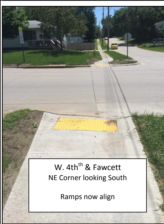
W. 4th th & Fawcett NE Corner looking South Ramps now align