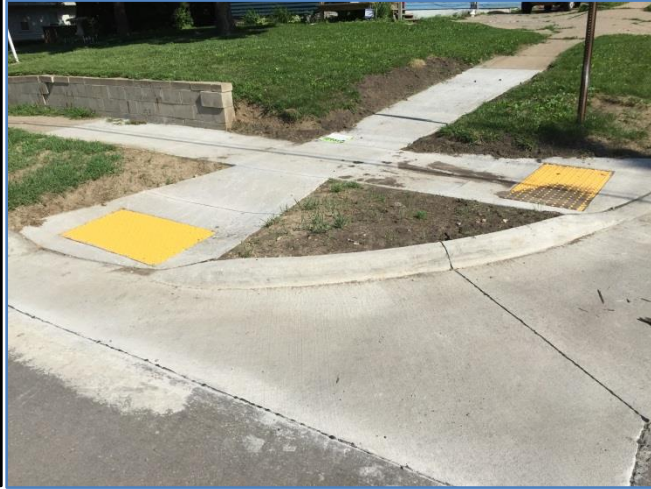
W. 4 th St & Leonard NW Corner Removed one corner ramp and added two ramps to students can cross intersection safely