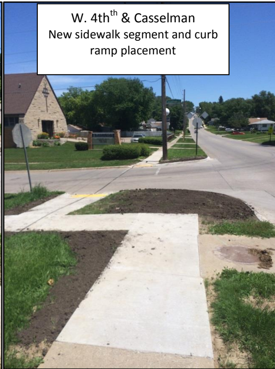
W. 4th th & Casselman New sidewalk segment and curb ramp placement